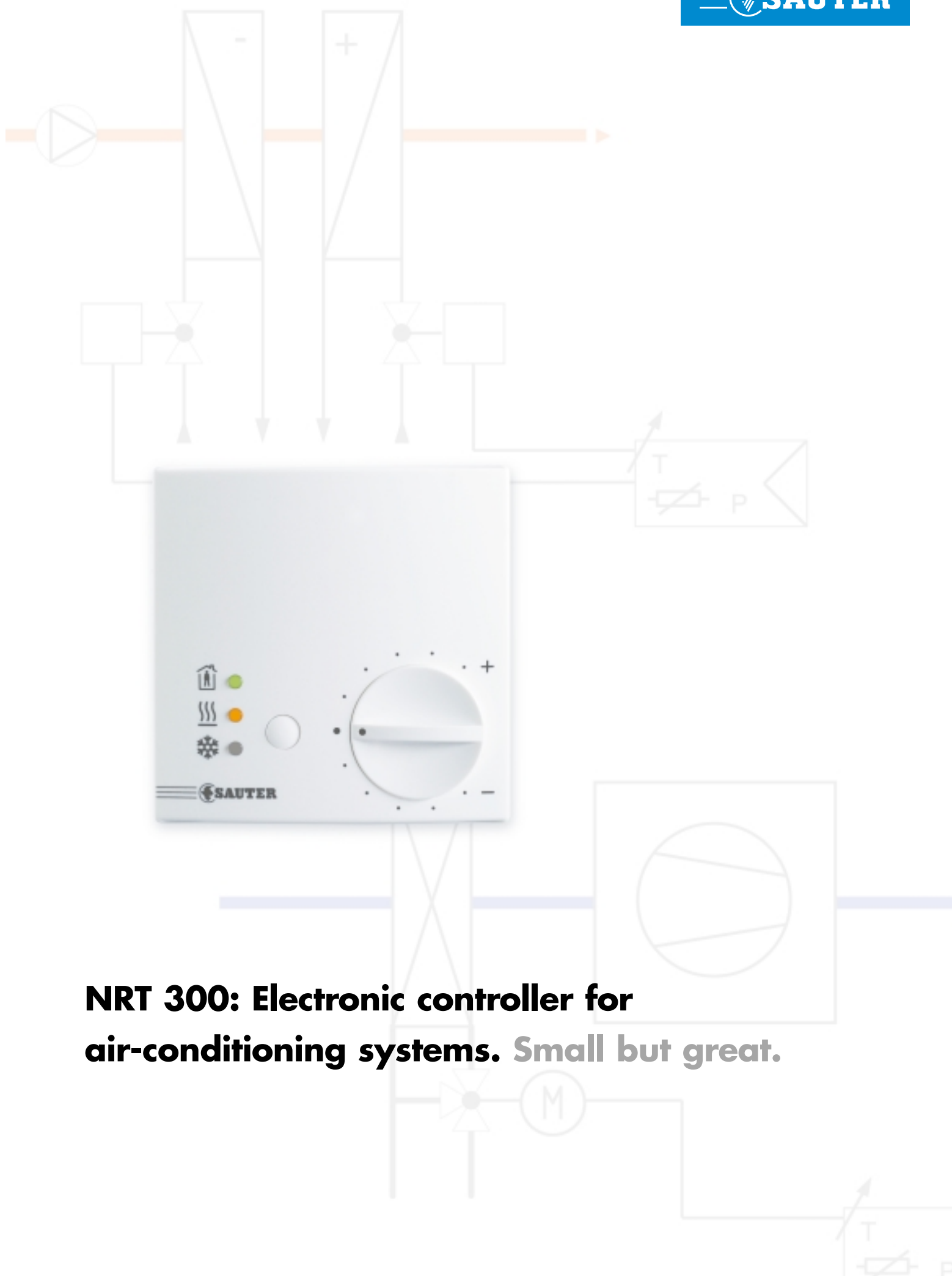
NRT 300: Electronic controller for air-conditioning systems. Small but great.